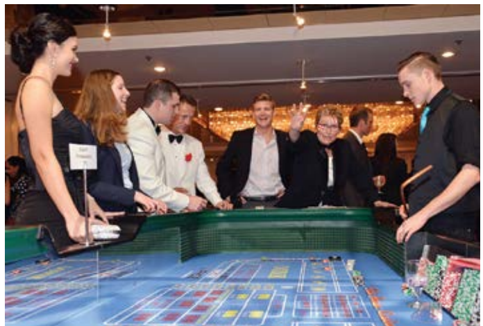
Rolling the dice for the win!